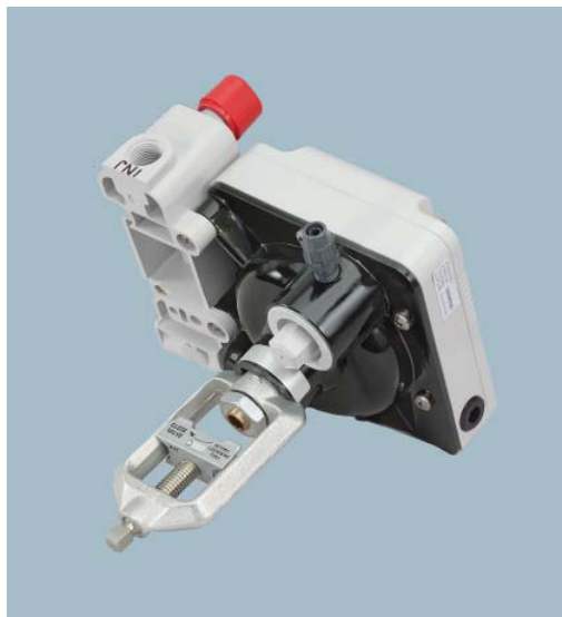
E10k™ Chlorinator (Rear View)

The E10k™ Chlorinator is warranted for 3 years against defects in material and workmanship. The vacuum regulating spring, injector spring, pressure relief spring, and inlet cartridge are warranted for life against chemical attack. The PM Kit® parts are warranted for 1 year.