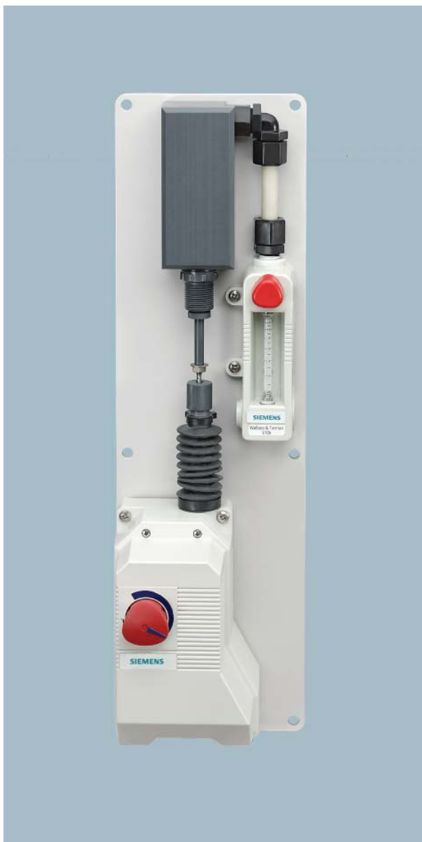
E10k™ Automatic Control Panel with 3" Flowmeter