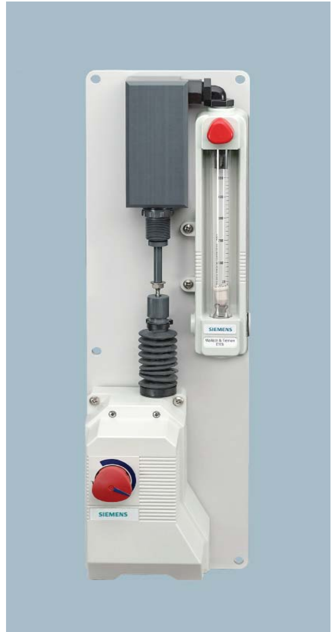
E10k™ Automatic Control Panel with 5" Flowmeter

For additional dimensional information see: WT.025.300.100. UA.PS and WT.025.300.102.UA.PS